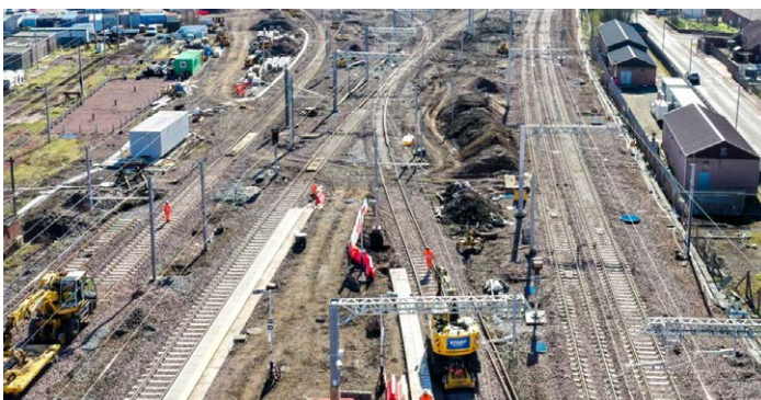
Arcadis determined that creating a digital twin of the project would not only improve the development of the project, but it would also minimize rail disruptions.

Using Bentley applications helped them reduce the time needed to create 3D models by 35%, ensuring the project remained within the schedule. Reviewing the placement of every element with Bentley View helped them to detect and resolve 15,000 clashes, along with any other necessary adjustments before construction.