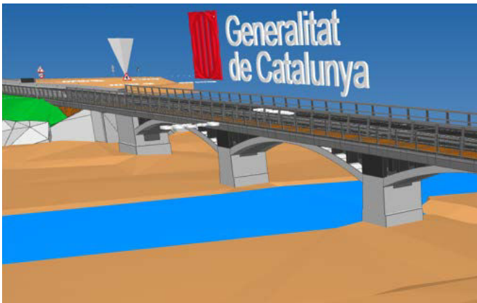
The century-old Cabrianes Bridge over the Llobregat River is being renovated to accommodate additional vehicular, pedestrian, and cyclist traffic.