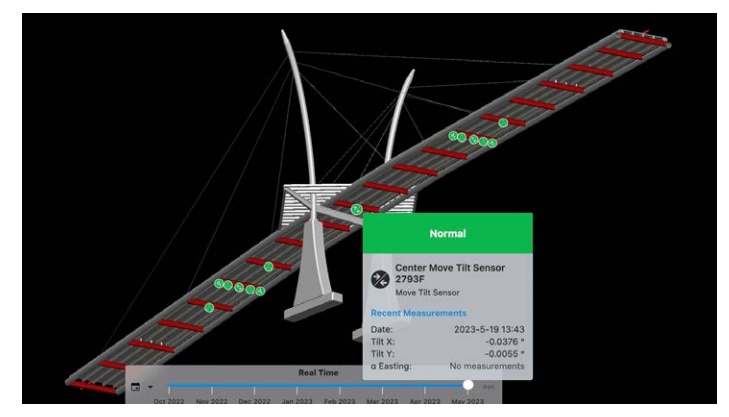
Connect any instrumentation system, IoT connectivity device, or smart sensor. Calibrate, validate, and process any data type.

With iTwin IoT, users gain access to the application anywhere and anytime via an internet browser.