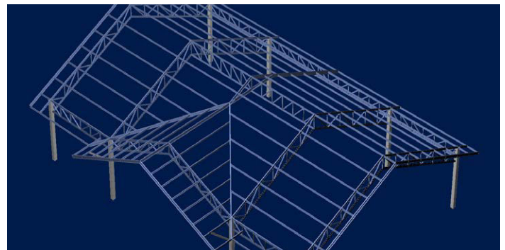
RAM Elements performs cold-formed steel design including optimization of these thin-walled sections subjected to bi-axial bending.