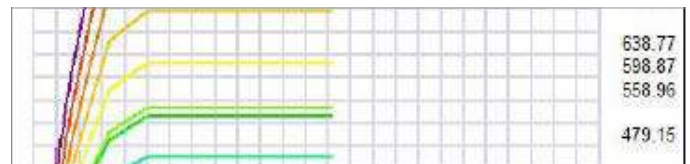
p-y curve generation for lateral analysis of drilled pier.