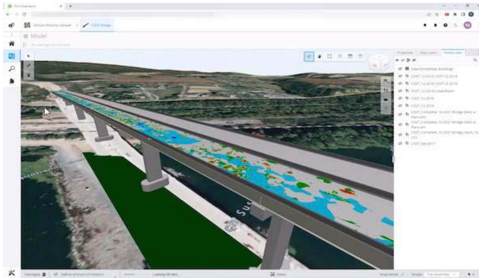
iTwin Experience.