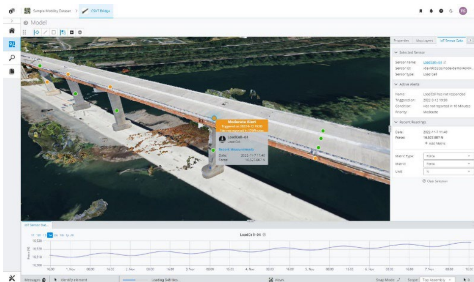
iTwin IoT.