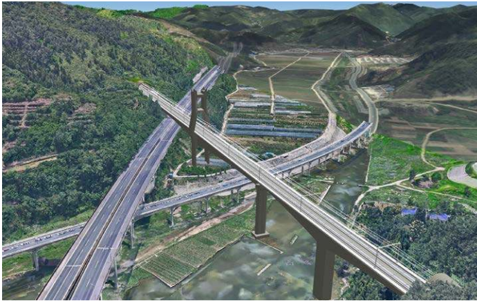
Bentley applications streamlined contributions from all disciplines, improving collaboration efficiency by 50%.