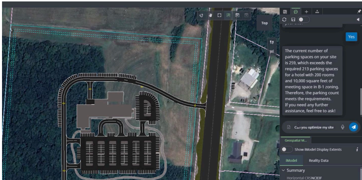
Bentley's OpenSite+ software with copilot uses organization-specific documents and design models for quick insights and edits.